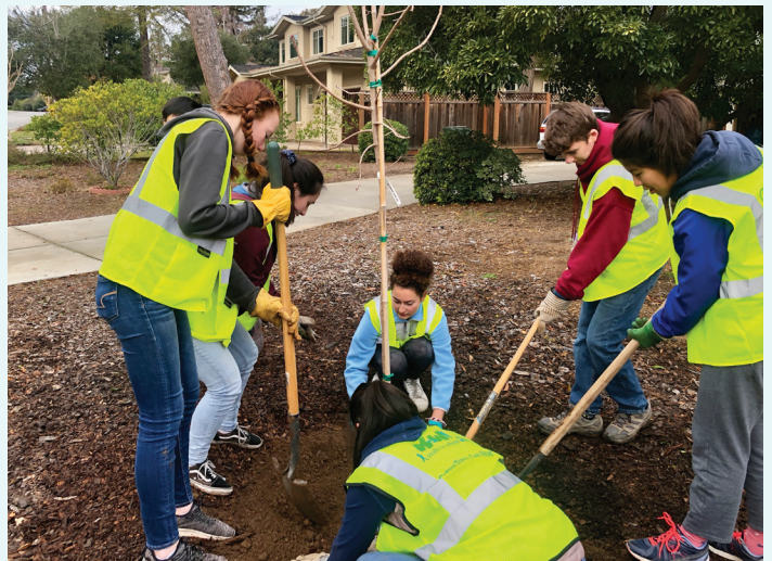
Volunteers planting a tree, one of 162 planted last year with the 500 Trees campaign.

Volunteers are the lifeblood of GreenTown Los Altos. We exist because of their incredible work, work that if it were paid would be valued at more than $118,537 in 2019-2020!