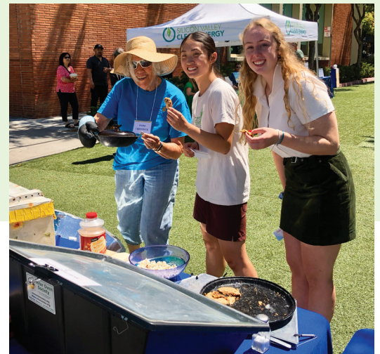
Two interns sampling solar-baked cookies at Energy Day 2019.

Reducing waste in our community is WAY more than recycling! The original 3 R's of sustainability: Reduce, Reuse, Recycle ...have evolved to include: Rethink, Refuse, Reduce, Reuse, Refill, Repair, Repurpose, Regift, Recycle, Repeat . We seek to support our residents, schools and businesses in their efforts to reduce waste, especially single-use plastic, and we advocate for local and state policies that reduce plastic use and pollution and reduce contamination of our landfills, lands and waterways due to toxic waste materials.