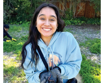
Woodland Garden volunteer discovers a worm in the rich soil she helped care for.