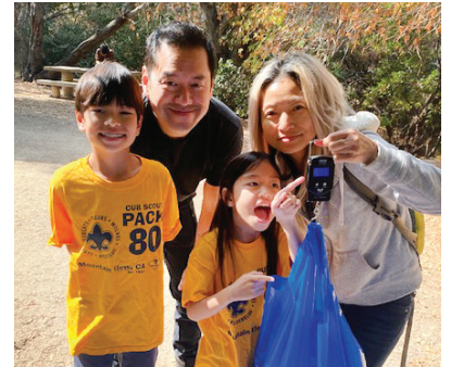
Creek cleanup volunteers making it a family affair.